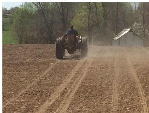
Livestock forage Crabgrass demonstration plot sown 4/23/2020