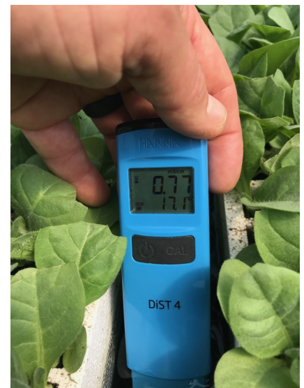
Assisting farmers with tobacco greenhouse production issues.