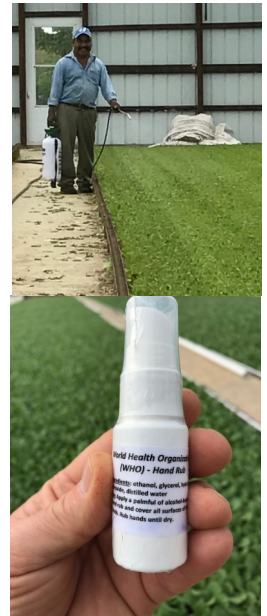
Hand sanitizer for Hispanic laborers

As for the Agricultural programs, we continue to field calls from farmers, landowners, homeowners, and Hispanic farm laborers. While putting all of our educational meetings on hold (for the time being), UT has still allowed agents to utilize on-site farm visits (while following all CDC safety protocols) to assist producers with production issues and management decisions, and conduct planned on-farm demonstrations. We have also created and shared a few videos as well. We continue to keep producers up to date on product marketing, COVID-19 protocols for the farm, as well as crop and livestock production information. One of our local businesses, which recently began to produce hand sanitizer, has graciously donated 70 bottles of the product which we are distributing to local H2A Hispanic laborers as they arrive on our local tobacco farms. Since this item is almost impossible to find, we are hoping that this will help, in at least some small way, to keep our farm laborers protected from the virus. Although we may be in trying times, the opportunities to serve our Cheatham county clientele abound, and we look forward to providing Real. Life. Solutions.