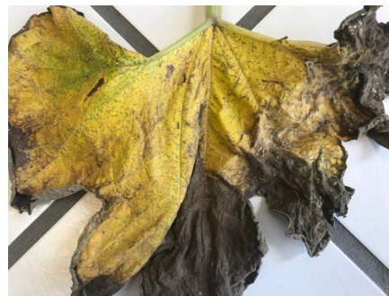
Commercial Pumpkin Leaf—Cucurbit Downey Mildew